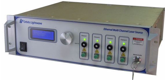
Multi-Channel Rack Mount System

The Eternal™ SlowLight™ fiber laser represents a new benchmark in laser performance. The highly integrated and robust fiber laser utilizes passive stabilization and eliminates the necessity for wavelength and temperature control. StableLase™ technology greatly reduces the susceptibility to shock and vibration by more than five orders of magnitude. This enables the Eternal™ SlowLight™ fiber laser to operate at unprecedented levels of stability and performance for demanding industrial or military applications.