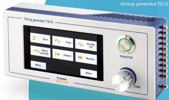
Laboratory type timing generator TG10

The timing generator can be used as a standalone unit with a touch screen interface (TG10) or installed as an optional add-on PCB board (SY4000-OEM). The TG10 device has an LCD touch screen for the manual control and a tunable knob for the adjustment of selected values set on the touch screen. Instructions of required actions are always displayed at the bottom of the screen. Besides, the timing generator has a digital control interface via CAN bus. Communication protocol with description for CAN is provided on request. CAN to USB converter is also available from EK SMA Optics.