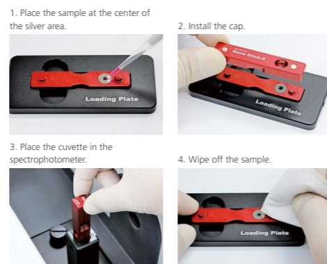
Fig. 2 Using a Nano Stick Cell