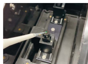
Fig. 1 TrayCell