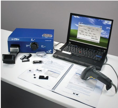
nanoDots slide in and out of the adapter (2D bar code facing front) for readout in an original microStar reader

This is a nanoDot with alphanumeric sensitivity code and serial number (DN091=0.91 sensitivity). Either the front or back of the carrier can face toward the radiation source during exposure