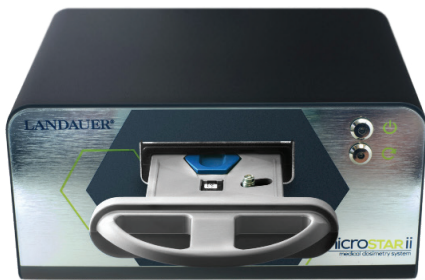
nanoDots are read directly in the microSTARii reader

InLight® nanoDot dosimeters are designed for use in single point radiation assessment applications and are engineered to be read out by two available InLight readers - the original microStar® and the newer and smaller microSTAR®ii. The nanoDot offers complete reanalysis, requires no dosimeter preparation in the clinic and has a labeled sensitivity that is built into the dosimeter 2D bar code for rapid, accurate reading.