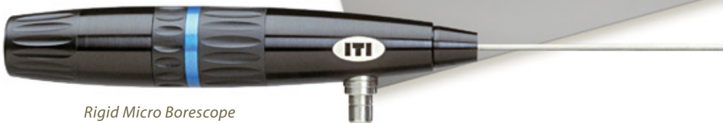
Rigid Micro Borescope